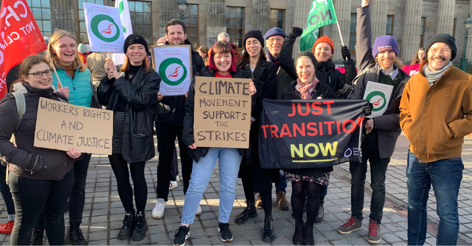
The staff team in solidarity with striking workers in Edinburgh in February 2023