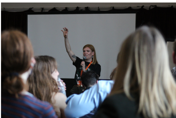
Photos, clockwise from top right: Stop Rosebank stunt as part of COP27 Edinburgh March; Divestment Day of Action at Edinburgh City Chambers; COP27 rally demanding freedom for Alaa Abdel-Fattah & Egyptian political prisoners; Edinburgh Climate Gathering; Friends of St Fittick's Park come to the Scottish Parliament; Standing with striking transport workers.