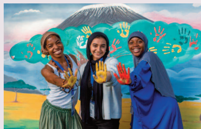
Climate Justice Camp, the largest in-person platform of its kind for young leaders in the Global South, in Tanzania, 2024.

It is also important to remember that the global south is not homogeneous. An important way of ensuring useful representation can be to target those countries or people within the global south most relevant to the consultation even if these are not Scottish Government partner countries.