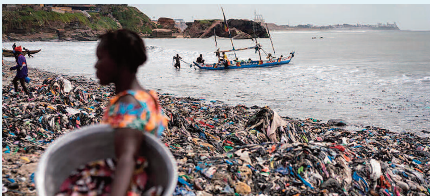
Textile waste washes into the sea in Jamestown, Ghana, 2023.