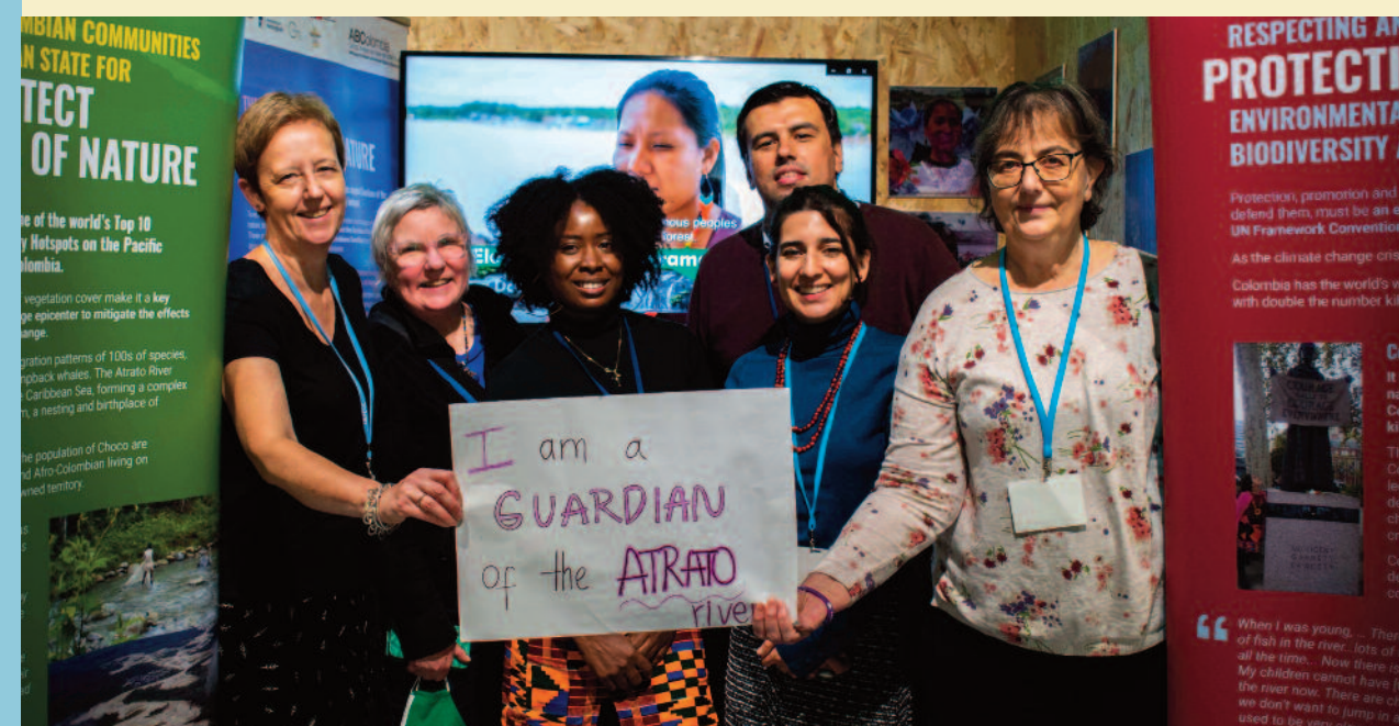
River Guardians exhibition, COP26.

Indigenous people are guardians of nature. There is strong evidence from multiple scientific studies that improved consultation with Indigenous people leads to better outcomes for the environment.