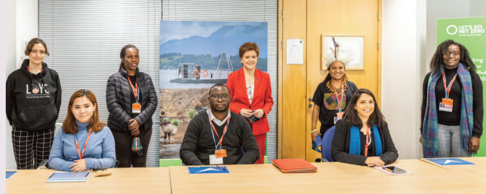
Scotland's First Minister, Nicola Sturgeon meets Global South representatives in Glasgow, 2021.