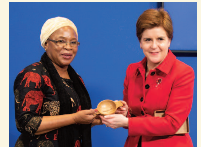
Scottish First Minister, Nicola Sturgeon, meets Hon. Nancy Tembo from the Malawian Government at the Glasgow Climate Dialogues, COP26.

Sometimes multiple consultations are issued on similar topics or several times throughout the journey of a piece of legislation. There can be good reasons for this, such as important and substantive amendments being made or if a consultation issued by the Government is repeated by the scrutiny Committee. However, too many similar consultations risks, not just fatigue, but lack of faith in the process that stakeholder views are being respected and listened to.