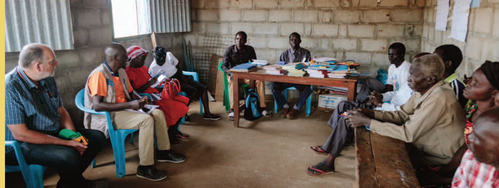
SCIAF programme workshop on inclusive education, South Sudan.