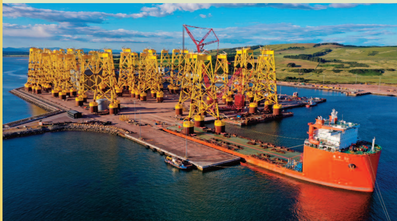
Offshore wind turbine foundations for use at Seagreen wind farm off the NorthEast Coast of Scotland.

A better designed consultation would have used a more neutral framing and included a more representative range of views in its analysis.