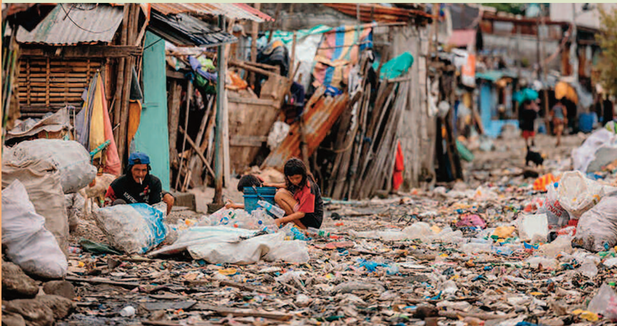
A girl scavenges plastic rubbish along polluted streets in Manila, the Philippines in 2023.

Those in affected global south countries can give an accurate and up to date understanding of their ability to manage a waste stream sustainably. Therefore, consulting with relevant global south countries is vital on this issue, as it is with so many of the international initiatives Scotland engages with.