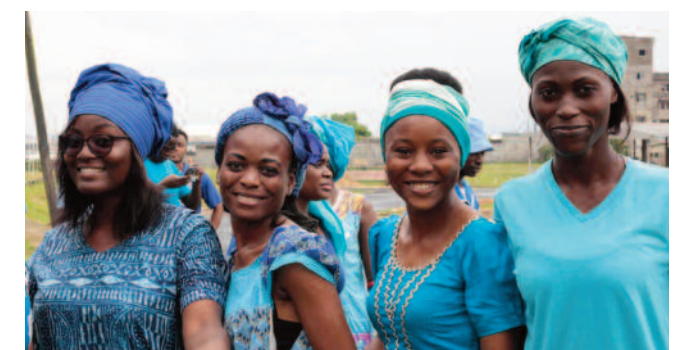
Volunteers at a World Ocean Day event in Cameroon, 2019.

Instead, steps should be taken to ensure sector-specific expertise, selecting participants based on their ability to contribute meaningfully to discussions on policy, development, and funding structures. This can sometimes be done with Scottish based organisations with expertise in the consultation topic who have fostered international partnerships. When possible, the Scottish Government should aim to foster long-term engagement, prioritising continuity rather than one-off participation that fails to build institutional knowledge and trust.