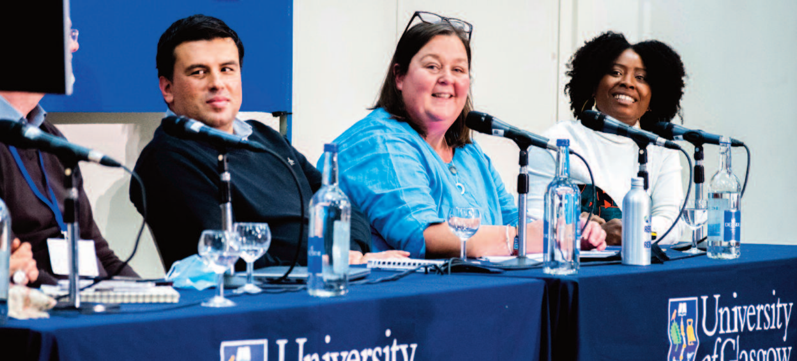
River Guardians from the Atrato River, Colombia attend a panel discussion with academics from Glasgow University, 2021.