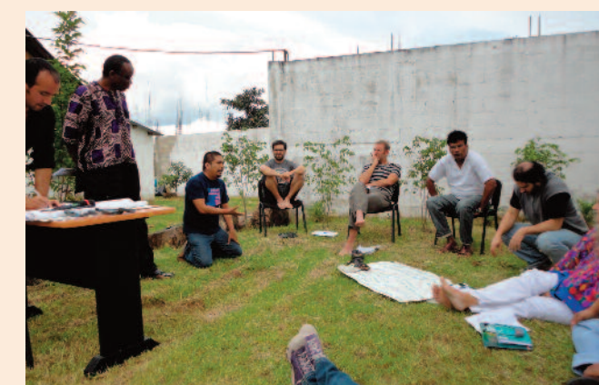
Friends of the Earth International meeting, Guatemala 2010.

However, by consulting with global south representatives where Scottish policies intersect with their interests, Scotland may demonstrate responsible international relations and uphold the National Performance Framework's principle that Scotland should be “open, connected and make a positive contribution internationally”.