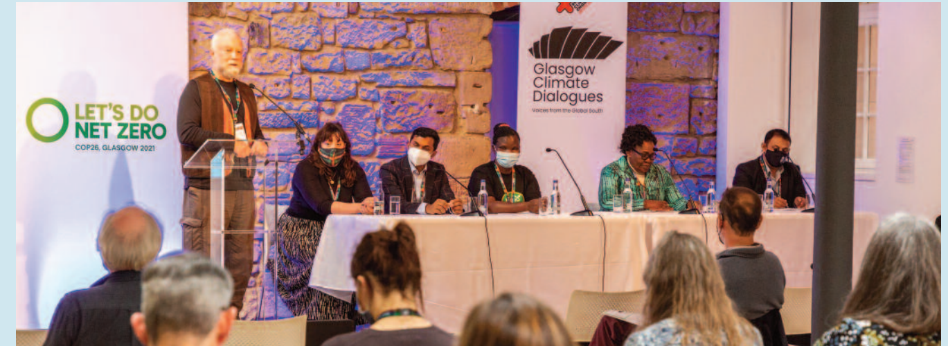
Glasgow Climate Dialogues workshop, 2021.

For consultations with global south representatives to be effective, the Scottish Government must go beyond symbolic participation. This requires carefully selecting the right participants, creating equitable engagement opportunities, and addressing structural barriers that prevent meaningful representation. The Scottish Government should prioritise representatives from community-based organisations, grassroots movements and local NGOs, particularly those working with marginalised groups. It should aim to foster long term partnerships, rather than one off participation.