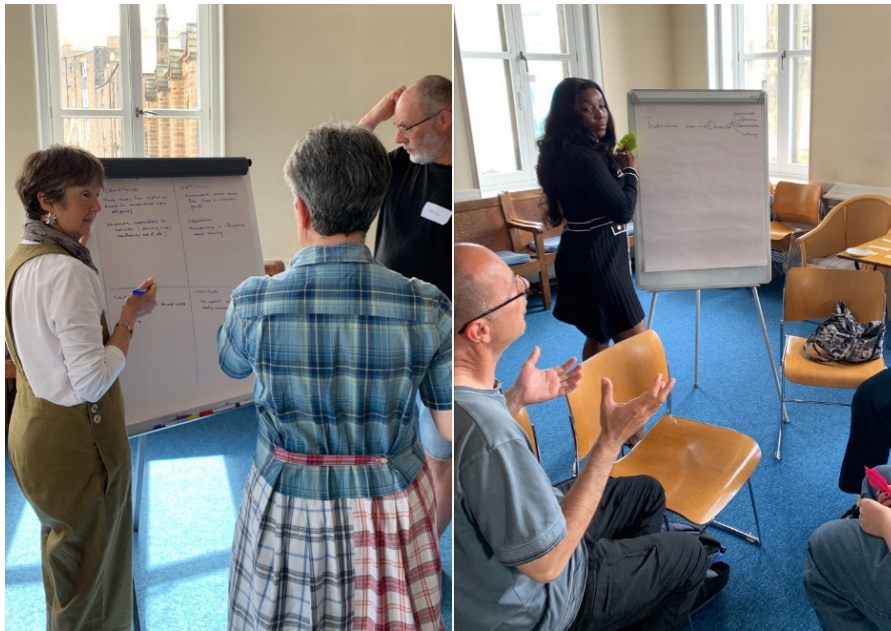
Edinburgh workshop participants discussing what a future with fair and sustainable material use looks like.

The workshops and draft plan were organised by Friends of the Earth Scotland, with involvement from people across Scotland's resource justice network.