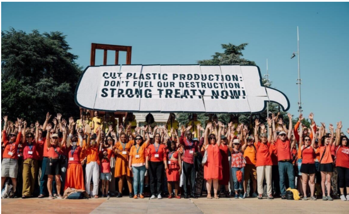
Activists from around the world show their support for a strong global plastics treaty.

Together, we can create a movement which is strong enough to build a better future.