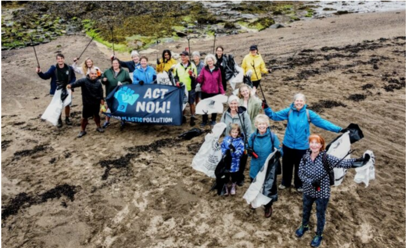
Plastic-Free Scotland Communities volunteers in South Queensferry calling for action to stop plastic pollution.

By recognising our shared goals and working together, our power to encourage change is increased.